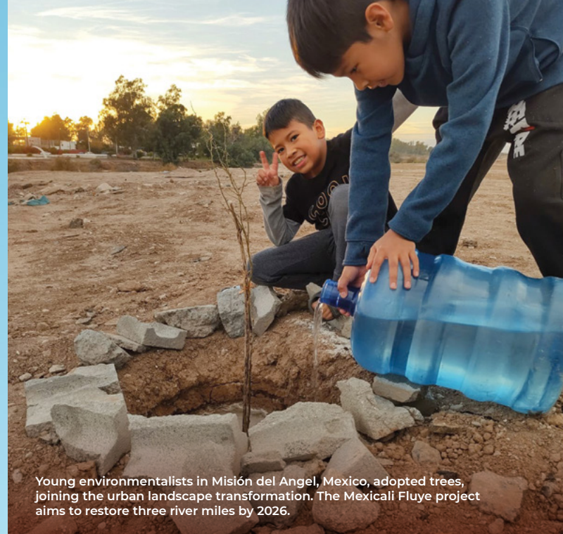
Young environmentalists in Misión del Angel, Mexico, adopted trees, joining the urban landscape transformation. The Mexicali Fluye project aims to restore three river miles by 2026.

The California Water Boards has granted us $4.3 million to restore the New River in Mexicali. Flowing from Mexico into Calexico, California, the river is considered one of the most polluted in North America. Impoverished communities on both sides of the border are particularly vulnerable to health threats from industrial, agricultural, and municipal waste in the water.