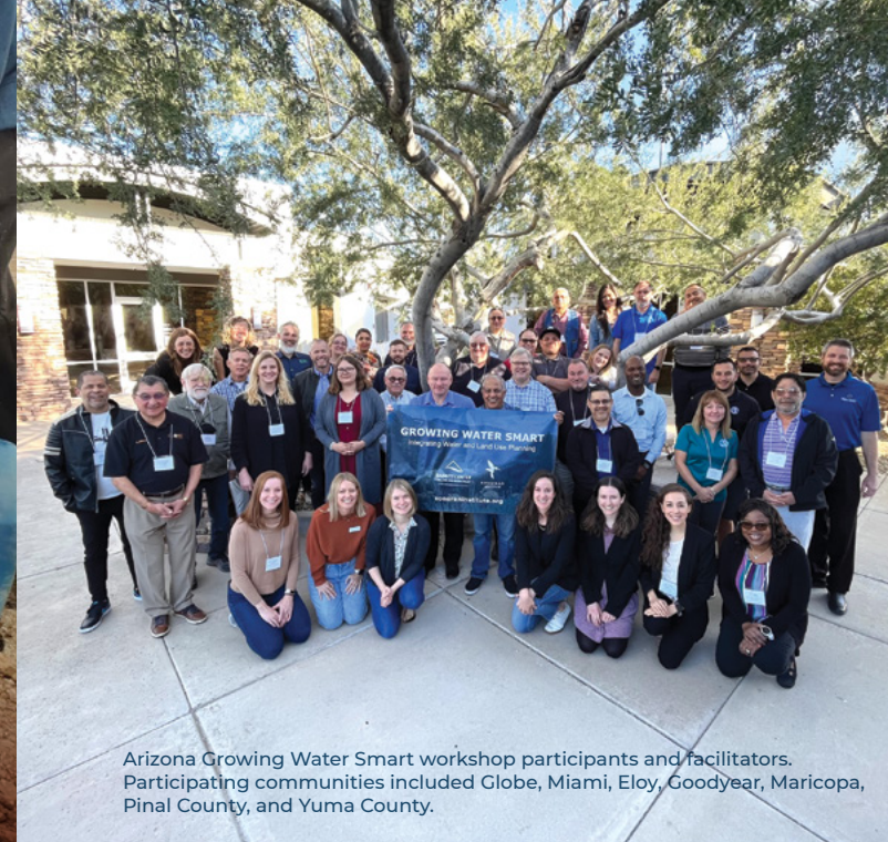
Arizona Growing Water Smart workshop participants and facilitators. Participating communities included Globe, Miami, Eloy, Goodyear, Maricopa, Pinal County, and Yuma County.