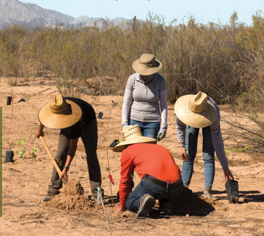
Volunteers planting trees at Laguna Grande

The proposed state park includes communities that have never received much attention or services, such as the indigenous Cucapá. We are excited about the benefits it would bring them.