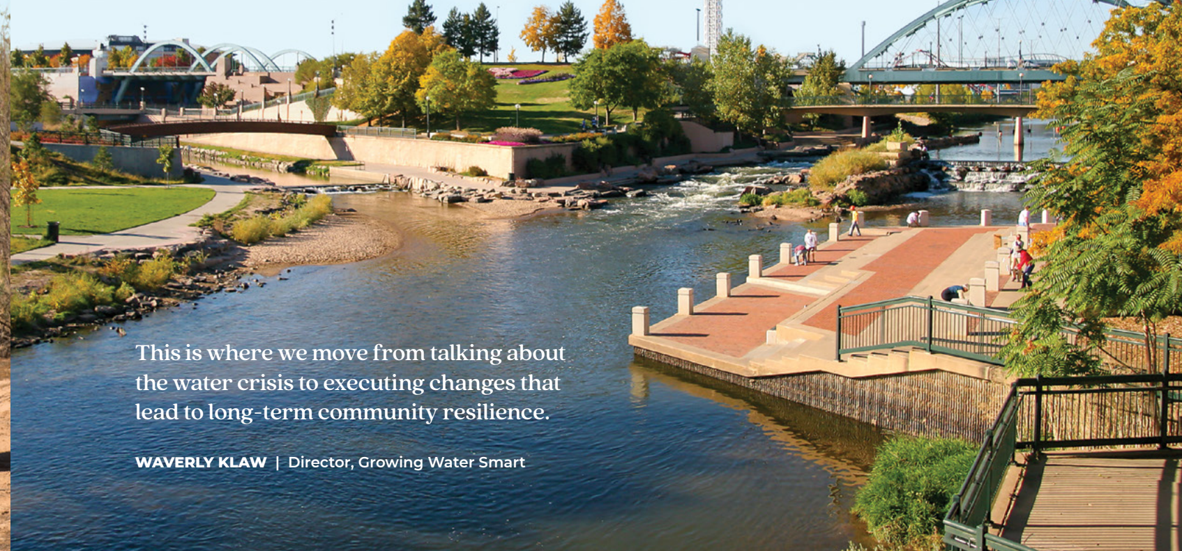
Green infrastructure in Colorado

This is where we move from talking about the water crisis to executing changes that lead to long-term community resilience.