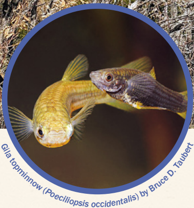
Gila topminnow ( Poeciliopsis occidentalis)