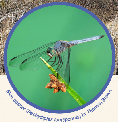
Blue dasher ( Pachydiplax longipennis)