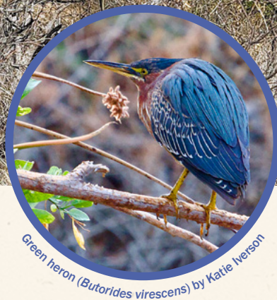
Green heron ( Butorides virescens)