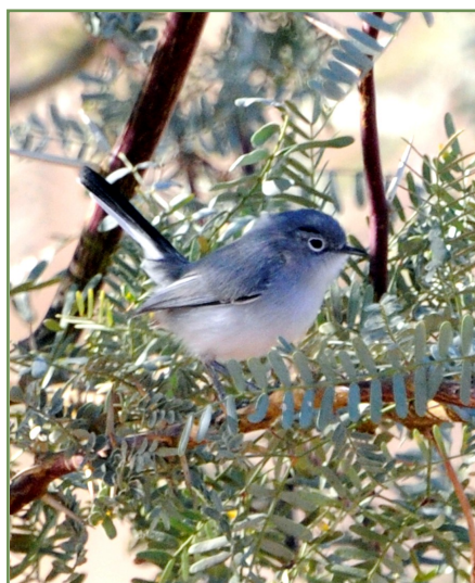
Blue-gray gnatcatcher perched on a mesquite tree in the reforested corridor