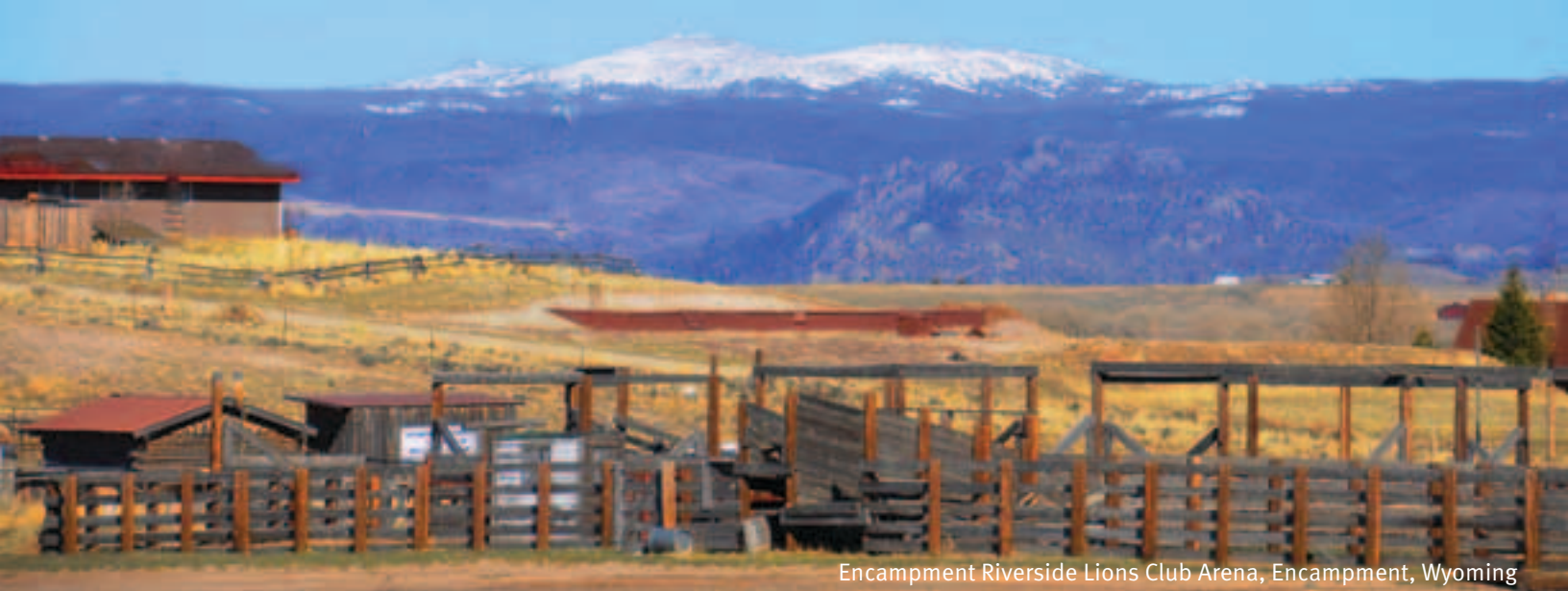
Encampment Riverside Lions Club Arena, Encampment, Wyoming