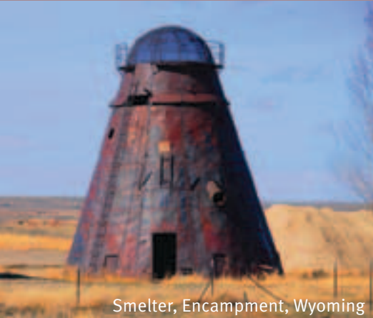
Smelter, Encampment, Wyoming